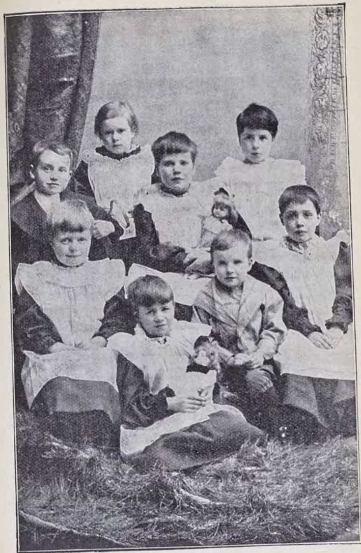
A Group of Motherless Ones. (Cheetham Hill Homes.)