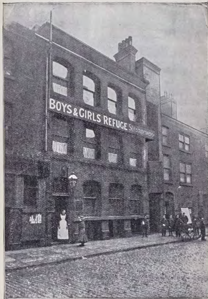
The Shelter, Chatham Street, Piccadilly.