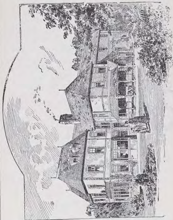
Bethesda Home for Crippled and Incurable Children.

Since the Mission was begun 80,289 men and lads, and 42,072 women and girls, or a total of 122,361 have accepted the invitation. Who can tell where, or to what extent, the seeds of kindness and Christian influence thus sown may not bear fruit.