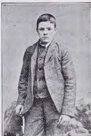
In the Refuge.

on; The Seven Family Homes for Orphan Children, Boys and Girls; The Working Lads' Home and Institute ; The Brigade Boys' Home ; The Emigration Training Homes for Boys and Girls; The Open-all-Night Shelter for little wanderers; The Girls' Domestic Service Training Home and Laundry ; The Bethesda Home for Crippled and Incurable Children; The Sea-side Home for weak and ailing children; The Summer Camp ,—June to Sept.—for Poor City Boys; The Day Nursery for the children of poor working Mothers; The Police Court Mission to Lads