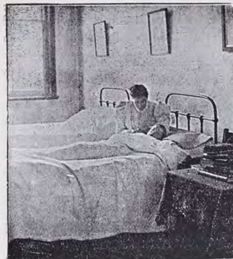
A Corner of Boys' Infirmary.

continues the head-quarters of the work, here are the offices, and here come nearly all the applicants in the first instance, except those that are brought to the Open-Day and-Night Shelter in Chatham Street. As stated in last year's report it is now a very complete home for working boys and school boys, and it is well fitted in all respects for carrying on the important work of which it is the centre. The Dormitories are bright and airy, the Workshops well equipped and active, the new Reading, Writing, and Games room, very popular, as is also the Swimming Bath, and Play Ground. Notwithstanding that the boys are busy at work or school all day, Classes and Meetings are held in the evening for Wood Carving, Musical Drill, Bible Class, Temperance Meetings, Lantern Lectures, Night School, etc., and are engaged in with real zest, not by any means as an irksome duty; these share with the