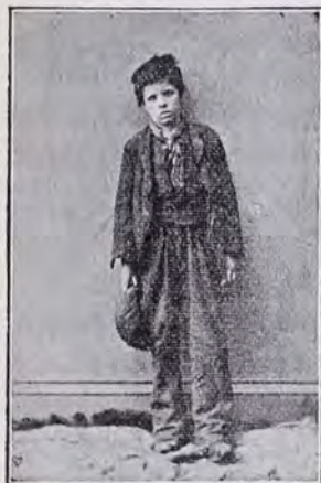
On the Streets.

The Central Refuge , where over 100 boys dwell, and where the various industrial operations are carried