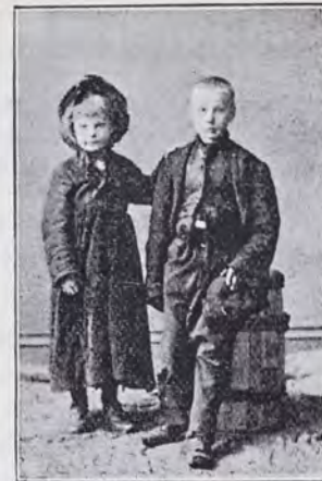
Uncared for in a Common Lodging House.

These have continued very full throughout the year,