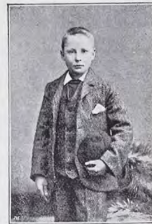
Loved and Cared for in the Homes.