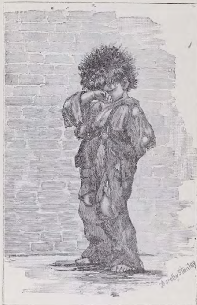
AS THEY COME TO US.