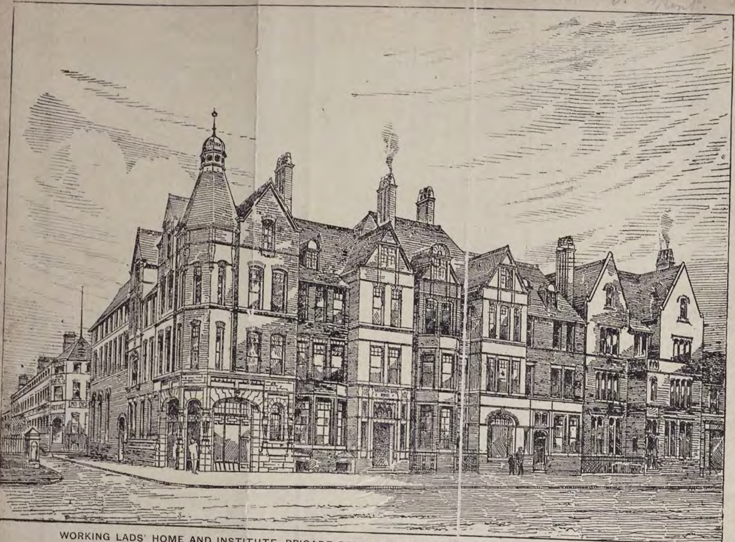
WORKING LADS' HOME AND INSTITUTE, BRIGADE BOYS' HOME, AND BOYS' EMIGRATION TRAINING HOME, GREAT DUCIE STREET, STRANGEWAYS.