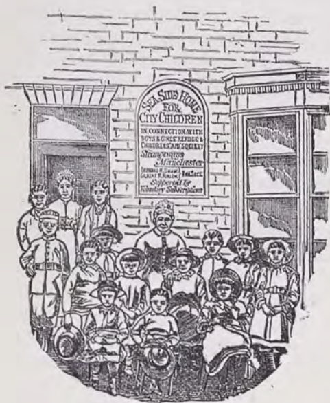
SEASIDE HOME, LYTHAM.

It is a very bright and happy Home, the details of management being undertaken by a local Committee at Lytham, to whom the Central Committee are deeply indebted, and specially to the two medical gentlemen who devote so much time to it.