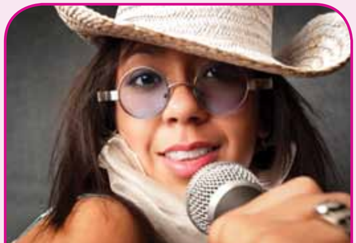
Name changed and model photography used to protect anonymity.

Elizabeth's future is bright. As part of the Together Trust 'family' she has newfound confidence and is already achieving things she never thought possible.