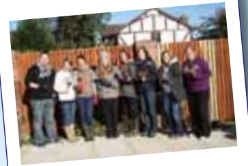
Marks & Spencer painted fences and tidied up the garden at Pocket Nook