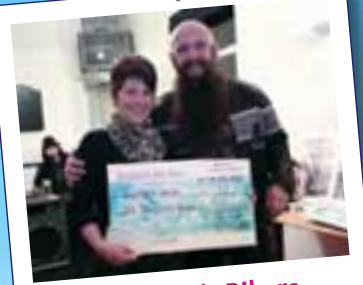
Roughley's Bikers donated £1,000 from their annual Bike Show